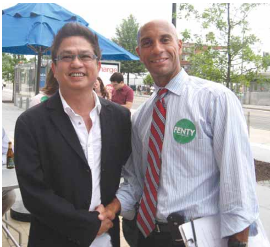
Mayor Fenty and DC council members Muriel Bowser and Jim Graham were among the many guests attending the opening reception of Sala Thai Petworth.

Now here’s a real find: The other night we were headed for a U Street restaurant when we stumbled upon what appeared to be a travel agency. The building was situated at 2004 17th St. NW, just off U. Closer inspection revealed Hana Japanese market, a tiny but well stocked grocery. There we found some fresh produce (Napa cabbage, daikon radishes), instant soba soup, miso paste, frozen (and dried) fish, Ramen noodles, Japanese candies and oceans of teas. Hana is open daily from 10 to 7 p.m. For more information call 202-939-8853.