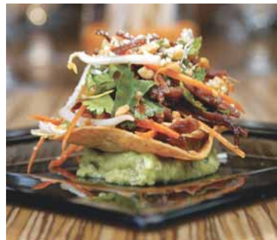
Masa 14's beef tostada and crab wonton – just two of the many small plates on the menu.

Also set to open later this year is Table 14, at 1832 14th St. NW, a "farm to table" eatery.