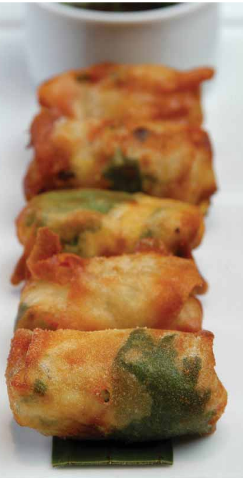
Eggplant Tapa's at Masa 14.