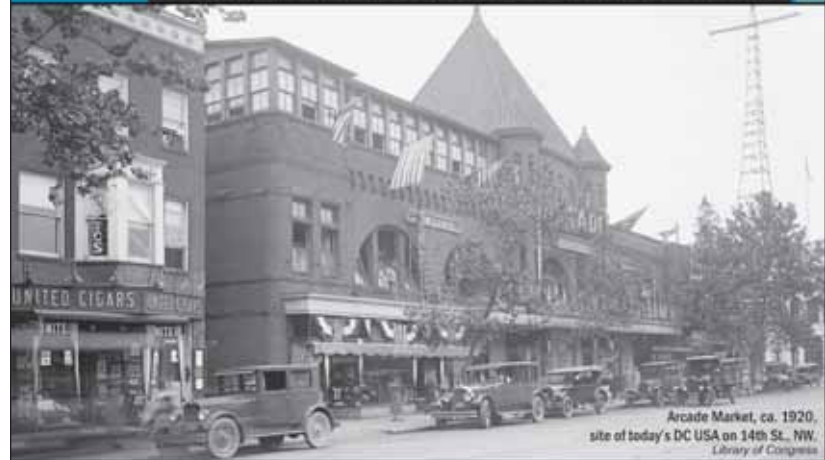
Arcade Market, ca. 1920, site of today's DC USA on 14th St., NW, Library of Congress