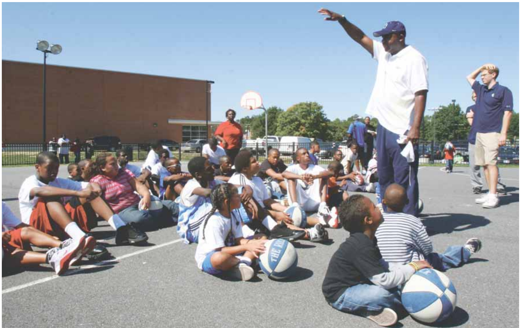
Neighborhood children receive basketball instruction during a block party Sept. 19 at the Turkey Thicket Recreation Center at 1100 Michigan Ave. NE. The John Thompson Foundation, which sponsored the event, centers its efforts on children whose health or educational opportunities may be at-risk.