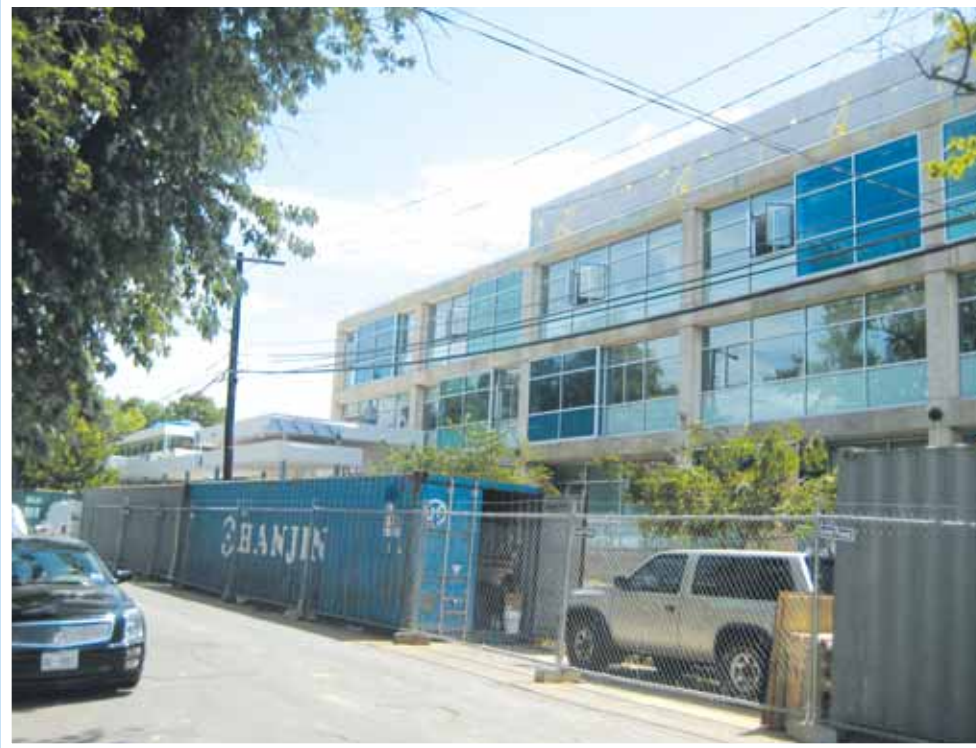
Renovations continue at Birney/Savoy Elementary School, July 31.

On July 30, H.D. Woodson's School Improvement Team discussed items including curriculum additions and a possible relocation of the 9th grade class. The curriculum additions, for the coming year, would prepare students for the new STEM (Science Technology Engineering and Math) curriculum to be launched with the newly renovated building. The possible move would respond to concerns – raised by some parents, students and teachers -- about the housing of 9th graders at Ron Brown Middle School, while 10-12th graders are at the Fletcher Johnson building. Concerns include lack of "high school" feel and role modeling for the younger students, travel logistics for athletics and activities. DCPS presented no decision timeline.