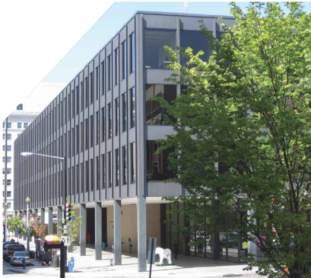
The Martin Luther King, Jr Library on G Street NW holds a theater lover's time machine.

Our tapes aren't quite as high quality as those of TOFT, where they spend many thousands of dollars to capture a Broadway musical using multiple cam-