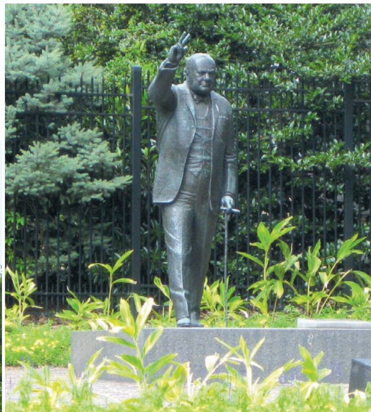
LEFT: Vice Presidential Residence on Observatory Circle.