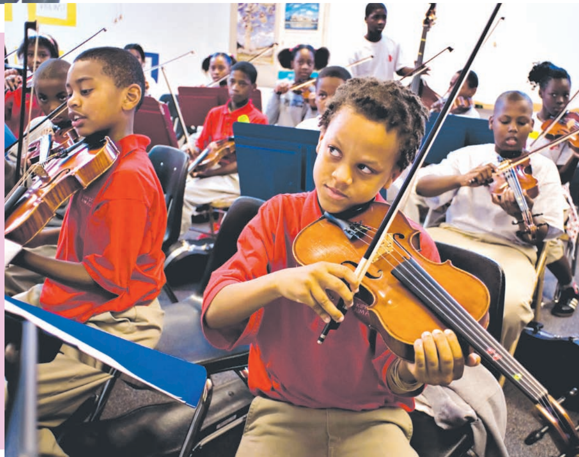
KIPP Students in music class.

KIPP DC recently announced that the seventh-grade students at the KIPP WILL Academy, located in the Shaw neighborhood at 421 P St. NW, were the highest performing math students in the city, as measured by the 2009 DC-CAS test, a standardized test issued to DC public school students. Ninety-nine percent of KIPP WILL Academy seventh-grade math students scored proficient or advanced in 2009. WILL Academy, which opened in 2006 in the Shaw neighborhood, is KIPP DC's newest middle school. It joined Ward 7's KEY Academy (4801 Benning Road SE), the network's flagship school, and Ward 8's AIM Academy (2600 Douglas Road SE) as one of DC's highest performing public schools. Test scores show that by eighth grade, students at KIPP DC's three middle schools outperform other DC public schools by over 100 percent in both math and reading. Two new KIPP DC schools, Discover Academy early childhood school and KIPP DC: College Preparatory high school, are joining AIM Academy this school year in the renovated Douglass Campus building (2600 Douglas Road SE) – KIPP DC's newest facility, located in Ward 8. KIPP DC's first and oldest middle school, KEY Academy, was again the highest performing public middle school in DC. Ninety-four percent of KEY Academy's eighth-graders were proficient in reading; 99 percent were proficient in math. Visit www.kippdc.org for more information about KIPP schools in DC.