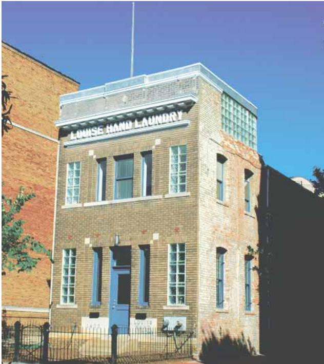
Louise Hand Laundry building