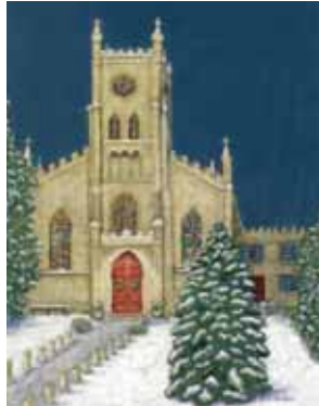
Drawing of Christ Church © 2006 Mary Ellen Abrecht

Check our website: www.washingtonparish.org