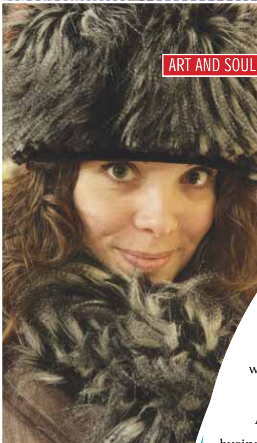
ART AND SOUL