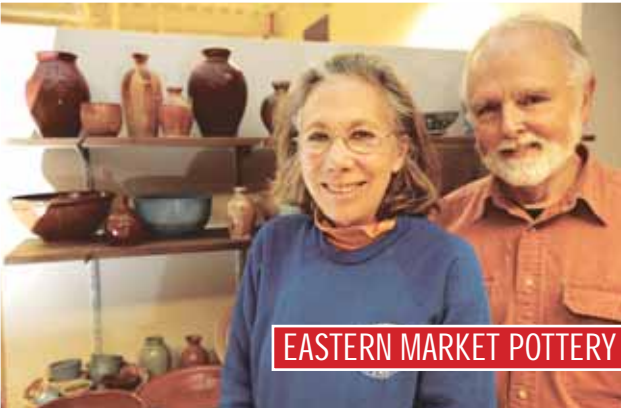
EASTERN MARKET POTTERY