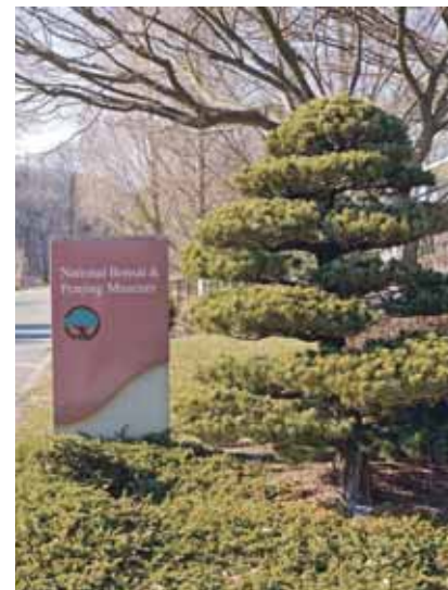
The sign for the Museum on the grounds of the US National Arboretum is easy to locate just past the Administrative building.

Today, the museum is the most visited site at the Arboretum with over 200,000 visitors yearly. In 1982, The National Bonsai Foundation, a non-profit organization, was established to sustain and support the public museum. The Foundation has over 400 members in all fifty states, and internationally. Many members are leading bonsai experts that not only provide financial support, but also provide advice to the curators, and are often involved in masterpiece displays and educational programs. Basic membership begins at $35 a year, and you can find more information at www.bonsai-nbf.org .