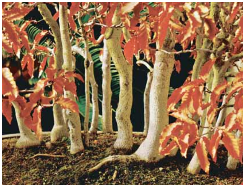
Pots can be filled with a number of trees to create a miniature forest.