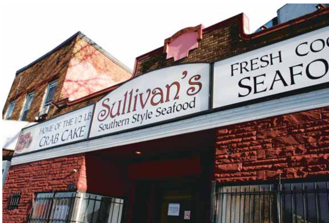
LEFT: Sullivan's Seafood isn't your typical carryout fare.

The Pug (1236 H St. NE, 202-388-8554) celebrates its third anniversary Feb. 13 with a fundraiser for the Lustgarten Pancreatic Cancer Foundation. Stop by and raise a pint for a good cause. A $20