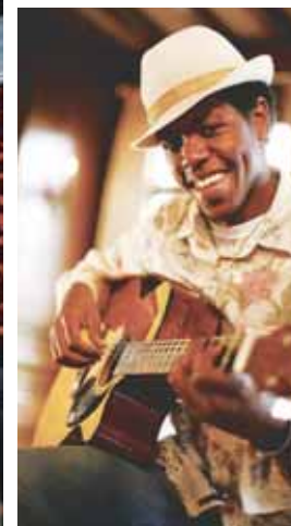
RIGHT: Folk singer Tom Chapin will perform at the Intersections Festival.