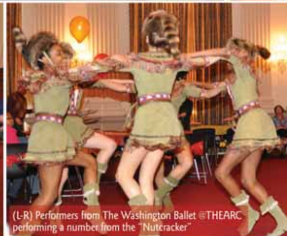
(L-R) Performers from The Washington Ballet @THEARC performing a number from the "Nutcracker"