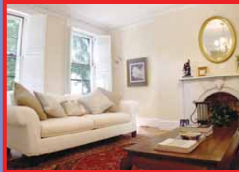
Razzle Dazzling Philadelphia Row! 124 11th Street, SE