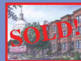
The ULTIMATE in Luxury Living! 608, 610, & 612 Maryland Avenue, NE!