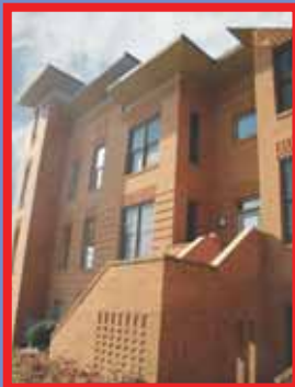
Condolicious 3 Bedroom! 263 14th SE #A Presented by Wm. C. Murphy