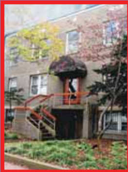
233 Kentucky Avenue SE Sparkling 2 Bedroom !