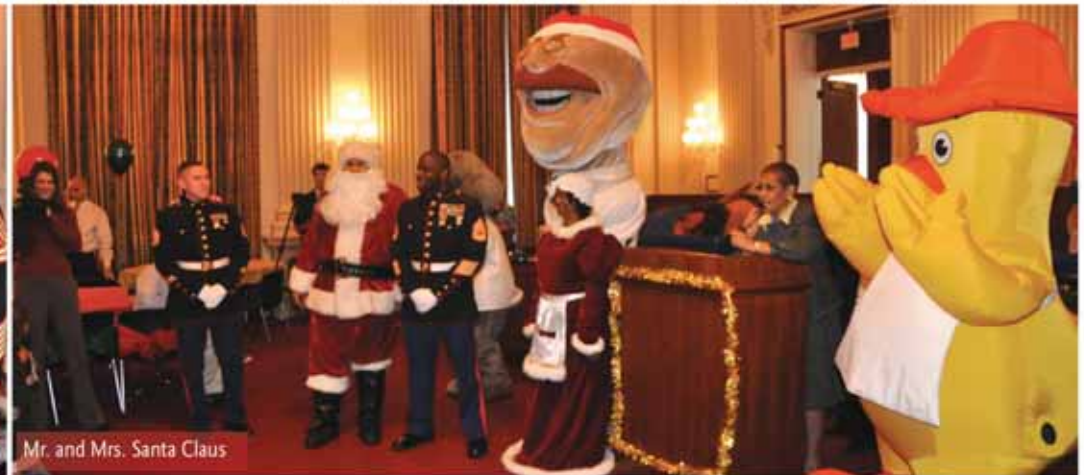
Mr. and Mrs. Santa Claus