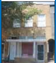
509 11th St, SE