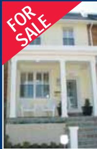
2416 2nd St. NE: $372K Renovated 2br 2 bath with off street parking