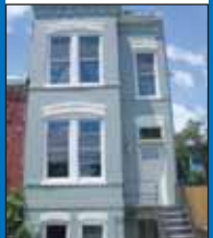
938 4th St, NE