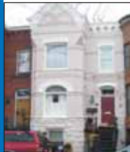
210 11th St, SE