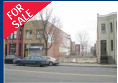
1216 and 1218 H St. NE: 2 vacant 1200 sqft commercial lots zoned C2A $190K EACH