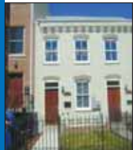
1120 K St, SE