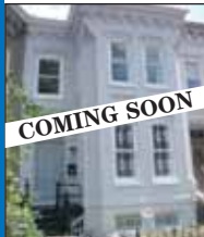
223 8th St, NE