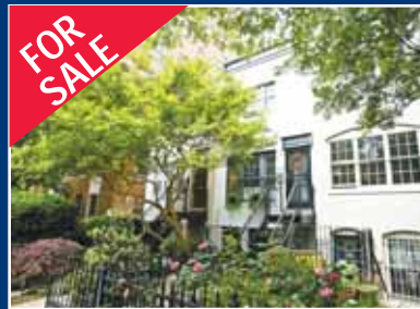
1908 New Hampshire Ave. NW: $1.1M 4br 3.5 bath w/ bsmt rental unit