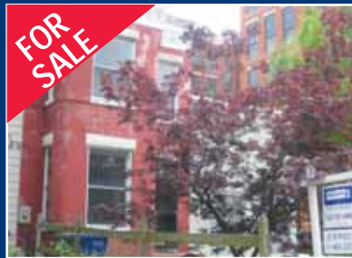
903 2nd St. NE: $425K 3br 1 bath renovated near Union Station