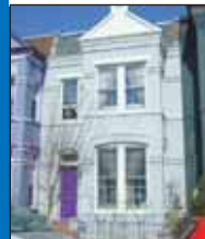
1228 D St, NE