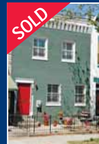
634 Morton Pl. NE: 3br 2.5 Bath + Parking $334K