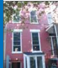
21 15th St, SE