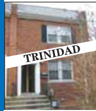
1119 W. VA, NE