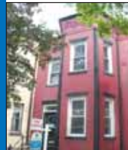
512 D St, NE