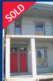
1117 6th St. NE: Multi Family! 2 Renovated Units each with 2br+1 Bath $399K