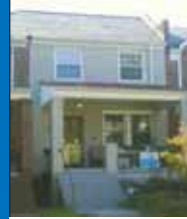
1631 D St, NE