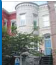
314 9th St, NE