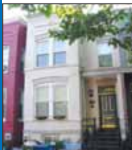
707 10th St, NE