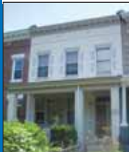
414 Kentucky, SE