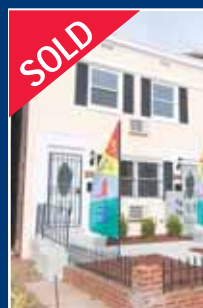
504 M St. NE #1: $227K Newly renovated 1br+ 1 bath condo 3 blocks to Metro