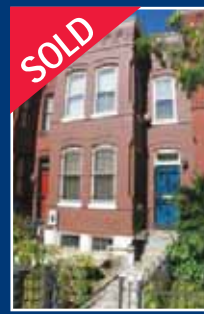
1430 F St. NE: $470K