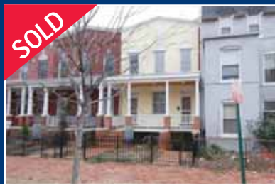
611 L St. NE: $670K HUGE Renovation! 5br, 3.5 Bth+pkg w/ rental Unit