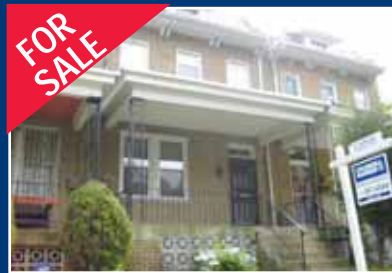
912 Madison St. NW: $375K 3br 1.5 bath with huge rear yard