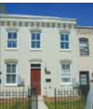
1122 K St, SE