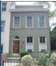
651 8th St, NE