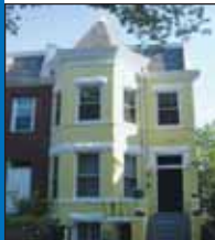
1308 E Cap St, NE

BIG BEAUTIFUL BAY w/ Three Lovely Levels! Lower Library w/ Built-In Bookcases, 2nd Kitchen & Bath, Seperate Entrances, Upstairs, open Living Room & Dining Room w/ Warm wood Touches, and Large Chef's Kitchen, 2 Bright Bedrooms, HUGE Backyard with Capacious Party Deck, Expansive Play Patio, Genteel Garden AND OSP! $650K.