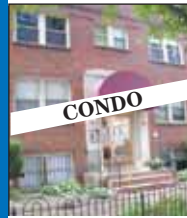
311 7th St, NE #T4