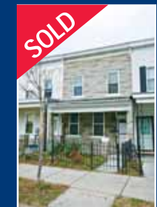
1714 Independence Ave SE: 2br 2bath with off street parking $337.5K