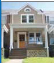
2002 C St, NE