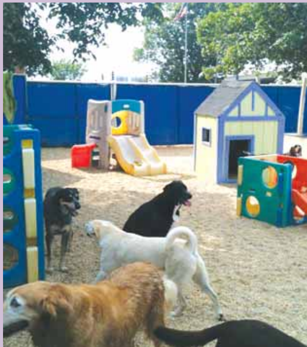
Indiana Jones, Fletcher, Little Boy Skai, Julius and Schroeder doing their daily business at Dog-ma.

So, what's in a (dog's) name? Possibly some confusion, if you happen to be one of several "Emmas" or "Scouts" playing at Dog-ma on the same day. Luckily, we've never had all of them board at the same time – there's over 25 of each, as well as tens of other "clients" sharing the same popular dog names. But after 11 years and thousands of clients, we've seen more than just the usual fare.