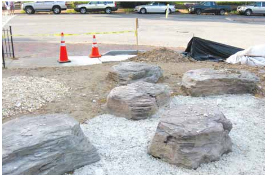
The Northeast Library's new patio features outdoor seating atop these six boulders.

Meridian International Center presents the fourth annual International Children's Festival, May 15, 10 a.m.-4 p.m., followed by the Alliance Francaise's Kids World Cinema, from 4-5:30 p.m. This educational fun-fair brings together the DC community and the diplomatic corps of Washington, DC, as embassies host booths highlighting their coun-