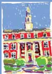
ALICE DEAL MIDDLE SCHOOL