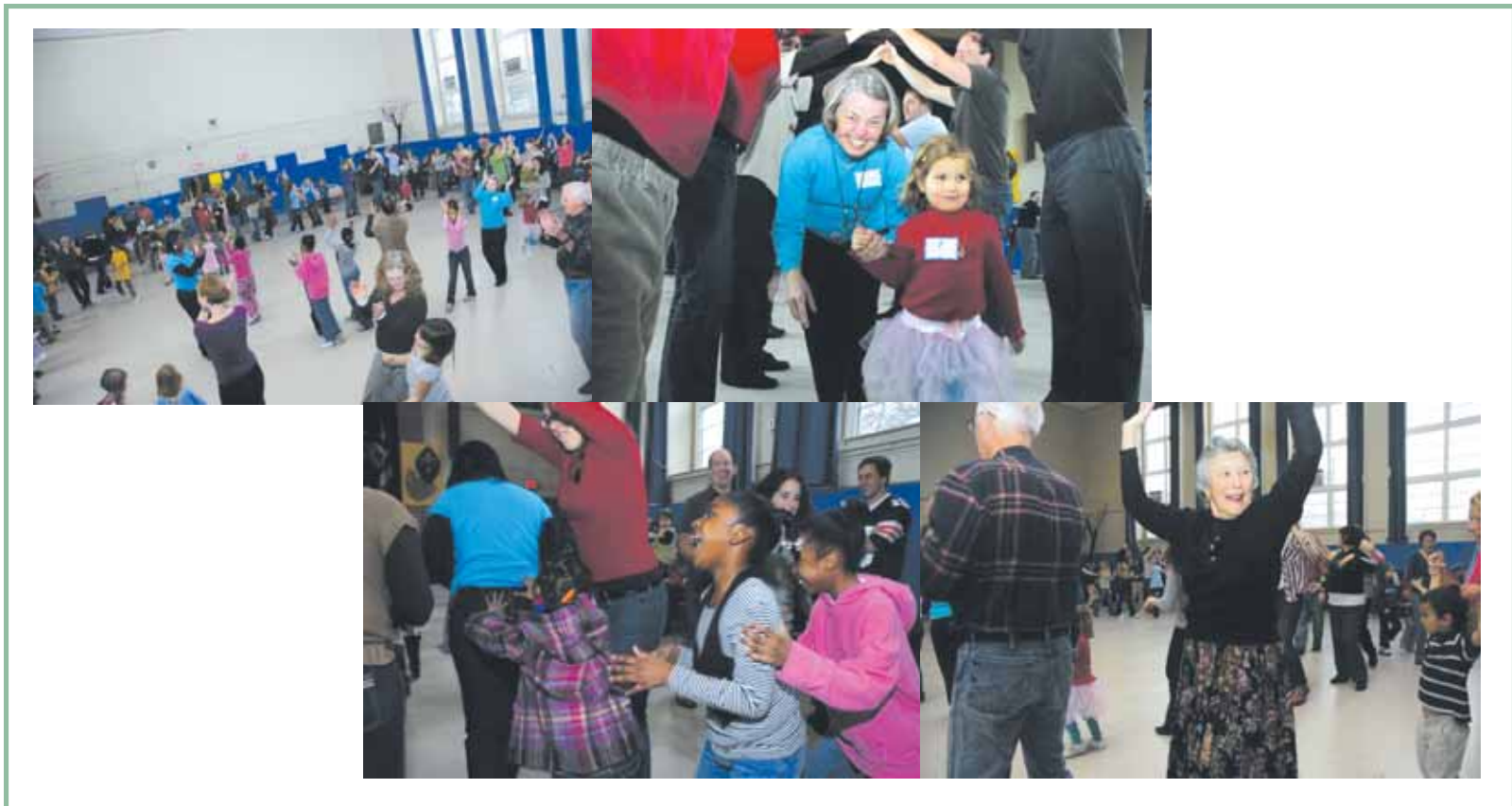
Having fun while square dancing on Capitol Hill!

sters in baby joggers and strollers and dogs on leashes are invited to participate in a one-mile fun run. Following the running events, runners can participate in activities focused on health and the environment until 11:30 a.m. $25/preregistration; $30/day-of registration. Adults can participate in the fun run only for $10. Children 13 and under are free. Register at www.fona.org or call 202-544-8733. The arboretum is located at 3501 New York Ave. NE. For information about FONA, visit www.fona.org or call 202-544-8733. For information about the Washington Youth Garden, visit www.washingtonyouthgarden.org or call 202-245-2709. For further information about Girls on the Run-DC, visit www.getrdc.org .