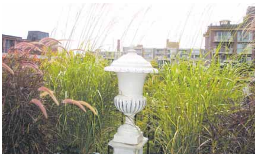
Balance and symmetry can be achieved with out being staid or predictable.

the internet. Take notes and pictures of designs that you like. Research the names of favorite plants. Pull together a list of the necessary elements your garden must have. Then edit out the things that are not going to work now or over the next five to ten years. Do not plant a maple that will become a 30-40' tree against your house. Though it may look great now, there will be a problem with this trees placement in time. If you take the time to develop your ideas, before lifting the first shovel of soil, tragic and potentially costly mistakes can be avoided.