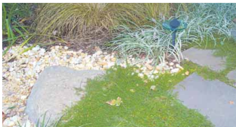
Contrasting elements can collide and still add to the overall design flow. Here Grasses contrast with each other as well as strong stone and lighting elements. The contrast is purposeful not contrived.