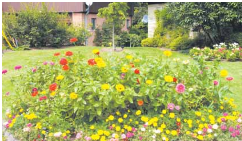
Repetition is achieved in this garden by adding color through out the landscape in drifts.