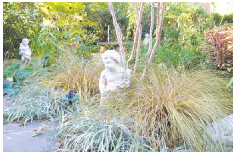
Here the three elements of balance and symmetry, repetition, and contrast collide seamlessly.