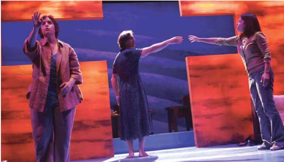
The cast of GALA's production of "Lúcido".

prime and it is a good thing he succumbs to sleep from time to time so you can watch the other performers do their fine work.