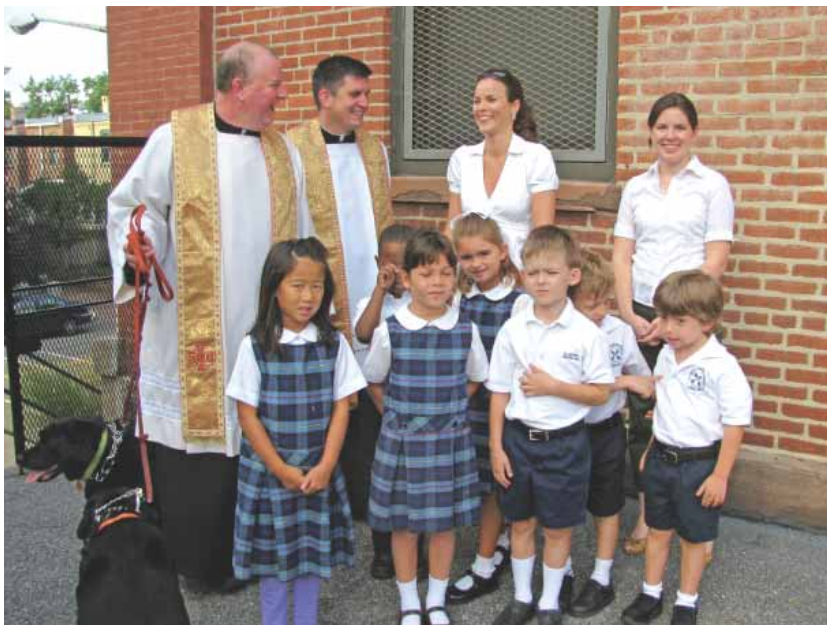
St. Peter's School Blessing during Back-to-School week