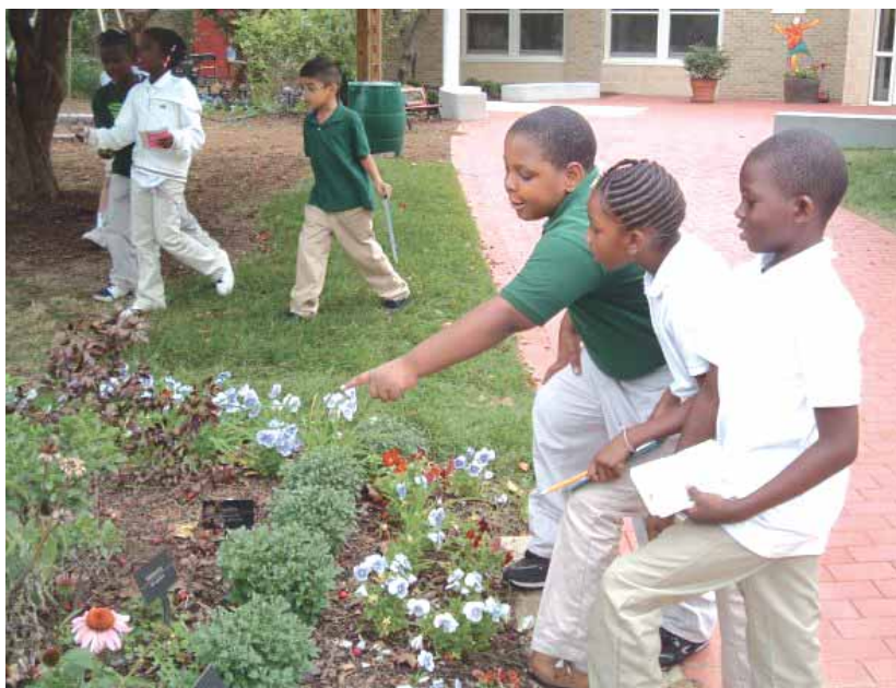
Brent 3rd graders participate in a scavenger hunt for plants, animals and green other features.