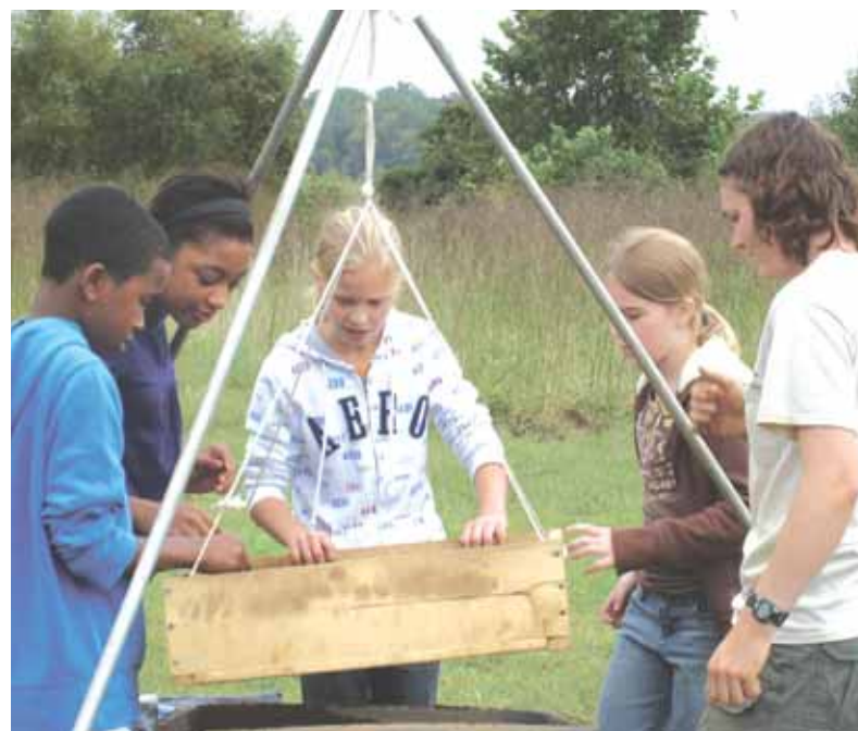
CHDS Grade 6 archaeologists search for evidence of past cultures at Mt. Calvert.

playground equipment, and it has added terrific new staff. Ludlow-Taylor rocks!