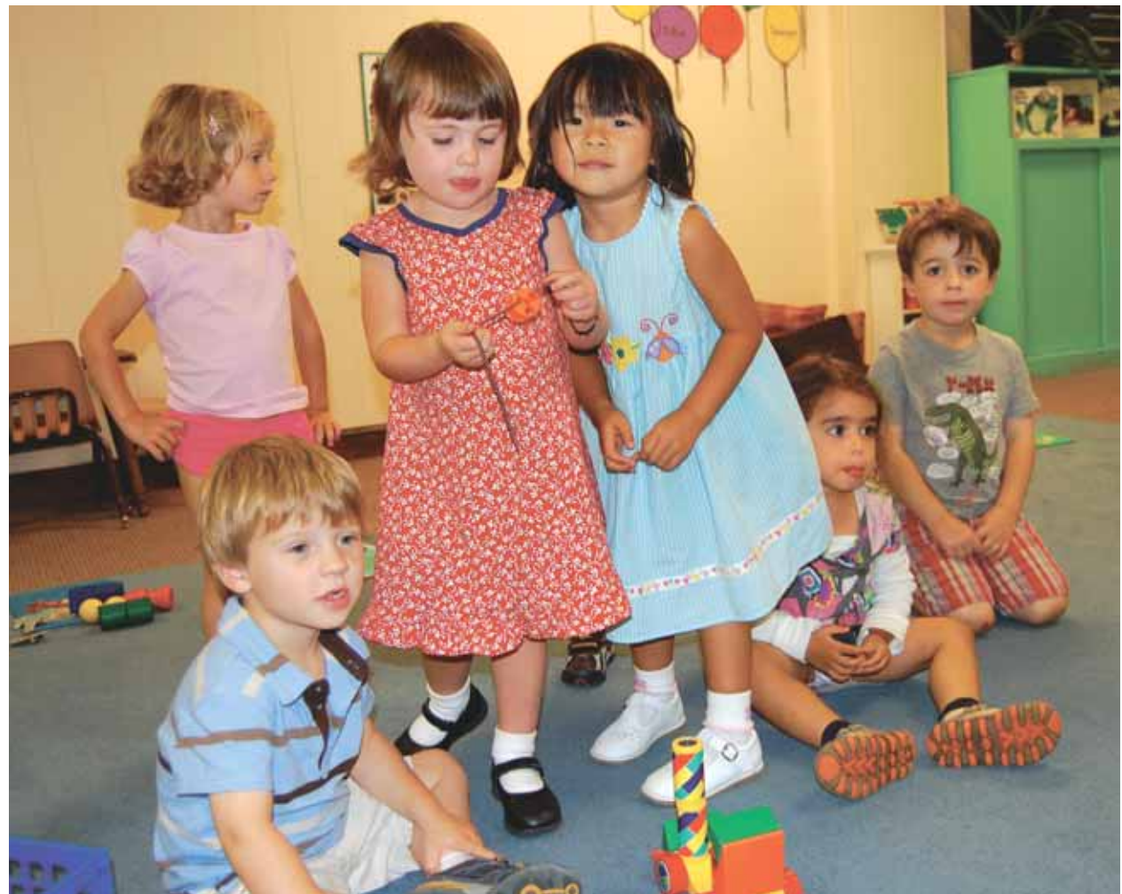
Students from River Park Nursery school pause for a photo.

Fall is in full swing at River Park Nursery School. The students are looking forward to their first field trip to the FDR memorial and are planning a special project featuring Roosevelt's dog, Fala. Other fun programs and activities are planned throughout the year, including the Fall Yard sale at Eastern Market and