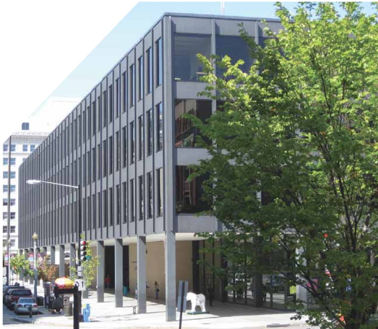
The Martin Luther King, Jr Library on G Street NW holds a theater lover's time machine.

Our tapes aren't quite as high quality as those of TOFT, where they spend many thousands of dollars to capture a Broadway musical using multiple cam-