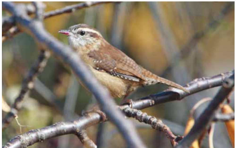
The Carolina Wren, taken at Congressional Cemetery.