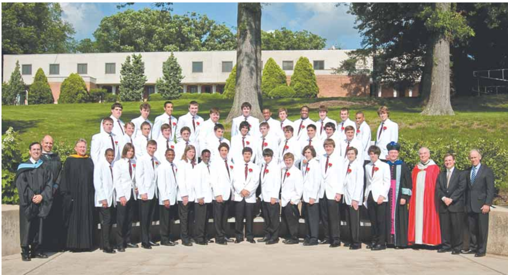
ABOVE: 2009 St. Anselm's Graduating Class.