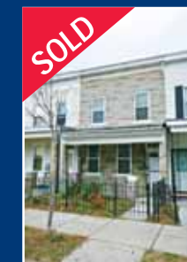
1714 Independence Ave SE: 2br 2bath with off street parking $337.5K