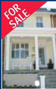
2416 2nd St. NE: $372K Renovated 2br 2 bath with off street parking