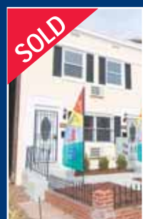
504 M St. NE #1: $227K Newly renovated 1br+ 1 bath condo 3 blocks to Metro