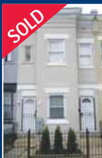
639 Orleans Pl. NE: 2Unit Multi-Family each unit 2br+1bath $309K