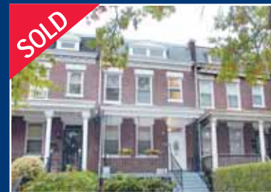
719 K St. NE: $425K 4br+2 Bath + Garage Parking