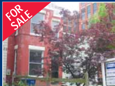
903 2nd St. NE: $425K 3br 1 bath renovated near Union Station