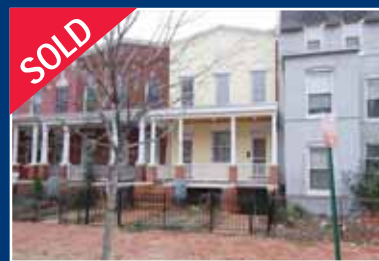
611 L St. NE: $670K HUGE Renovation! 5br, 3.5 Bth+pkg w/ rental Unit