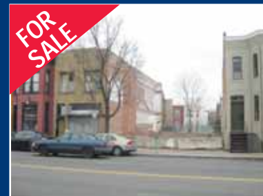
1216 and 1218 H St. NE: 2 vacant 1200 sqft commercial lots zoned C2A $190K EACH