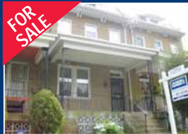
912 Madison St. NW: $375K 3br 1.5 bath with huge rear yard