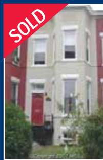
416 L St. NE: $507K