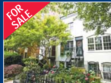
1908 New Hampshire Ave. NW: $1.1M 4br 3.5 bath w/ bsmt rental unit