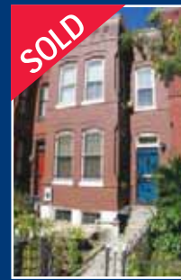
1430 F St. NE: $470K