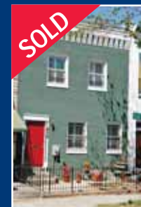
634 Morton Pl. NE: 3br 2.5 Bath + Parking $334K