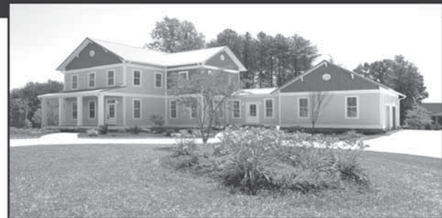
THE FARM HOUSE - 2,499 sq. ft. 3 bedrooms, 2.5 baths. Only $425,000.

We're 5 minutes from Danville, but you'll feel like you're 50 miles from any town. It's that beautiful and serene! Five couples from Washington have already bought here. It's a beautiful place to retire if you're not ready for a condo!