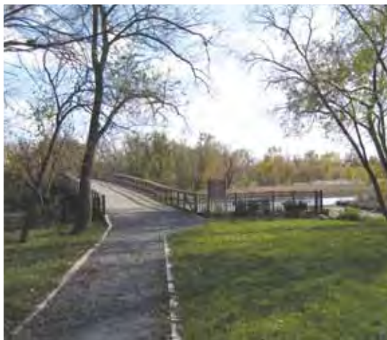
The Anacostia River is a natural beauty. RIGHT SMALL: The wooded trails of Kingman Island. LEFT SMALL: The bridge to Kingman Island.